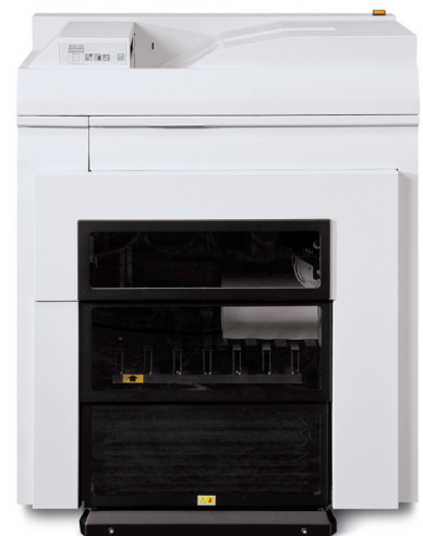
Xerox® Production Stacker

The Basic Finisher Module (BFM) stacks and staples documents and works well with all stackers in the finishing portfolio. All BFM's are capable of stacking up to 3,000 sheets (20 lb/75 gsm) and can staple up to 100 sheets using one or two staples. The BFM comes in a tandem configuration for those who need maximum productivity for stapled sets. The BFM+ and BFM-Direct Connect can also pass paper to downstream third-party finishers or any stacker.