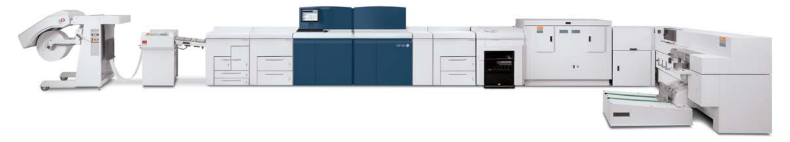
Xerox® Nuvera® 314 EA Perfecting Production System with Lasermax Roll Systems SheetFeeder NV-R, Xerox® Production Stacker and Xerox® Book Factory