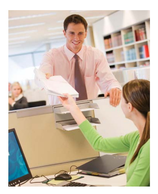
From feeding to finishing.

The Xerox® Nuvera® 200/288/314 EA Perfecting Production System offers a comprehensive set of features to meet the needs of your business, your environment and your customers. From feeding to finishing, it's a system that's all about helping you to accomplish what matters most to you—and enabling your success.