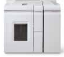
Basic Finisher Module – Direct Connect