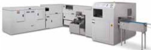
Xerox® Book Factory