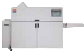
C.P. Bourg BDFNx Booklet Maker with Square Edge