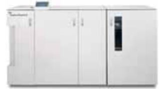
GBC FusionPunch II with Offset Stacker