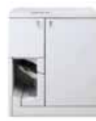
Xerox® Tape Binder