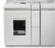
Basic Finisher Module Plus