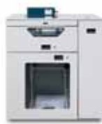
C.P. Bourg BSFx Dual-Mode Sheet Feeder