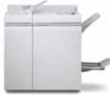
Multifunction Finisher Pro Plus