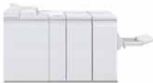
Plockmatic Pro 30 Booklet Maker (Available on 100/120/144/157 only)