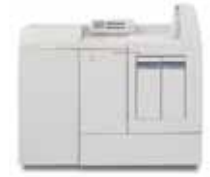
Xerox® DB120-D Document Binder