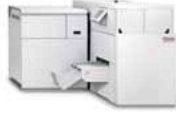
Watkiss PowerSquare 200