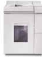
Basic Finisher Module