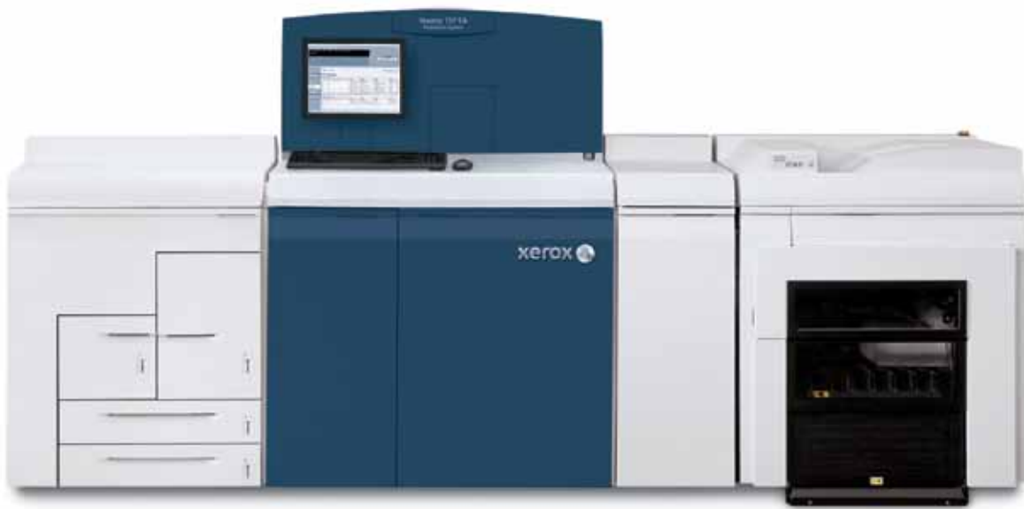
Xerox Nuvera® 157 EA Production System with Xerox® Production Stacker