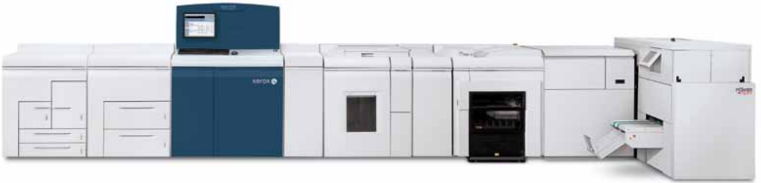
Xerox Nuvera® 157 EA Production System with Xerox® Production Stacker and Watkiss PowerSquare 200