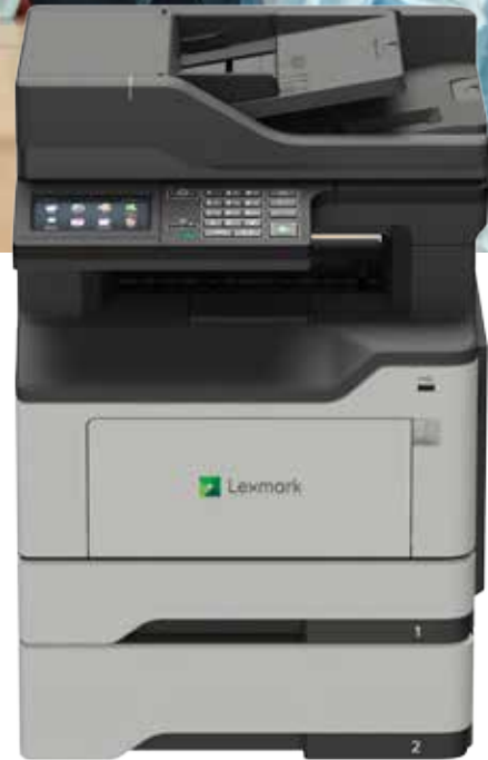
MB2442adwe with optional tray